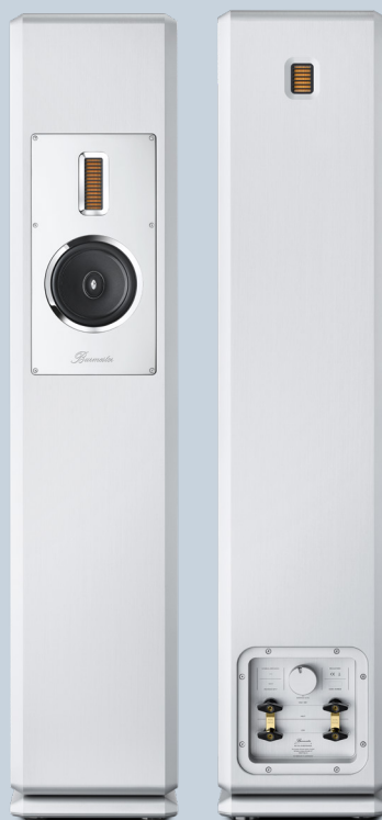
BC150 REFERENCE LINE